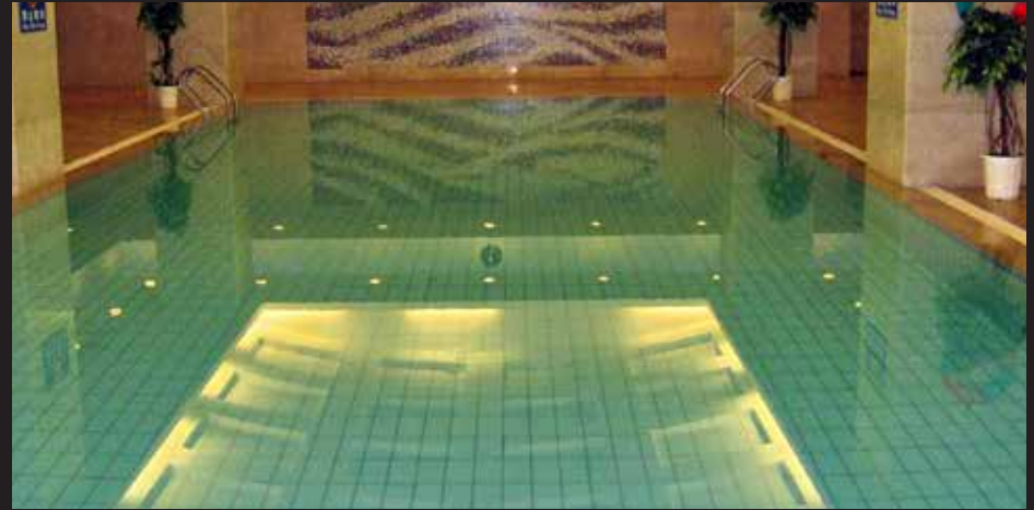
INDOOR HEATED POOL