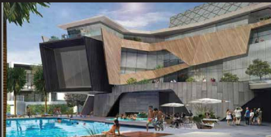
EXPANSIVE GOLF CLUB