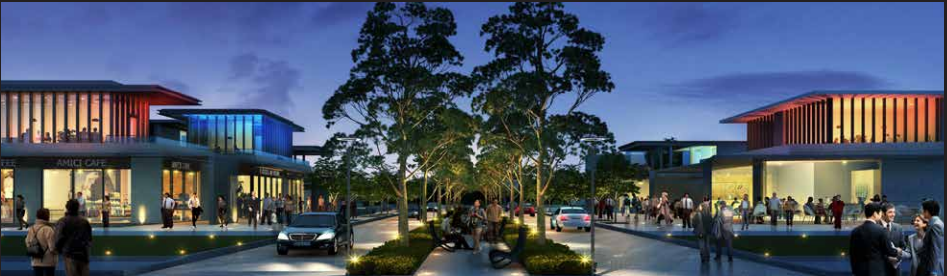
HIGH STREET RETAIL