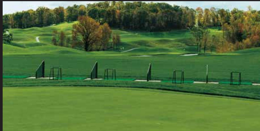
HIMALAYAN RANGE PRACTICE ACADEMY