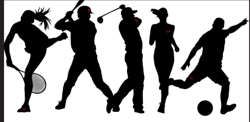
STATE-OF-THE ART SPORTS ARENA