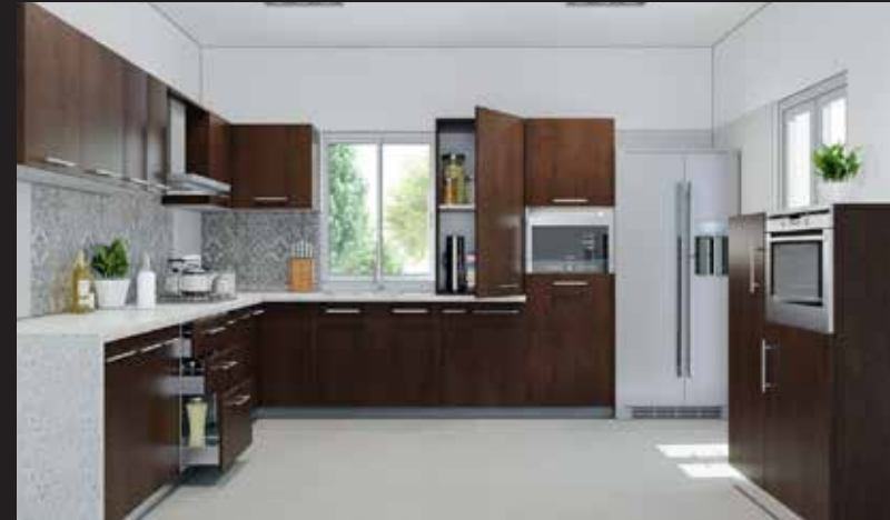
DESIGNER KITCHEN WITH BUILT IN APPLIANCES