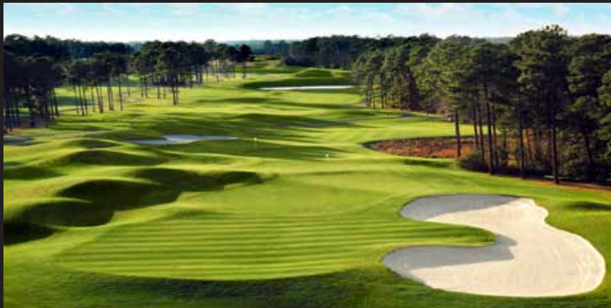
9 HOLE ORGANIC GOLF COURSE