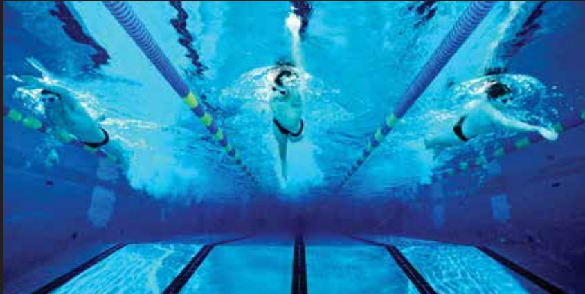
OLYMPIC SIZE SWIMMING POOL