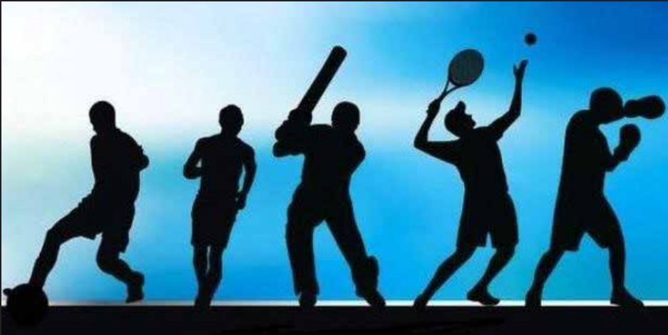
SPORTS ACADEMY BY TENVIC