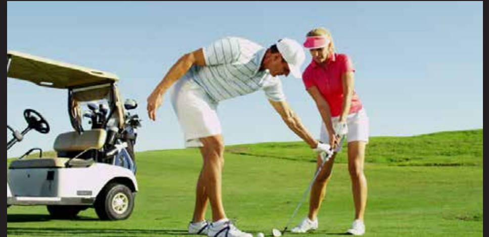
GOLF ACADEMY BY GOLFING NATION